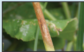
Gummy Stem Blight