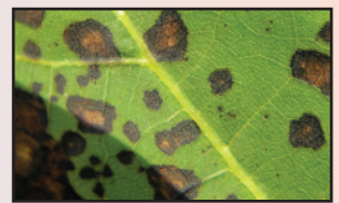
Cercospora Leaf Spot